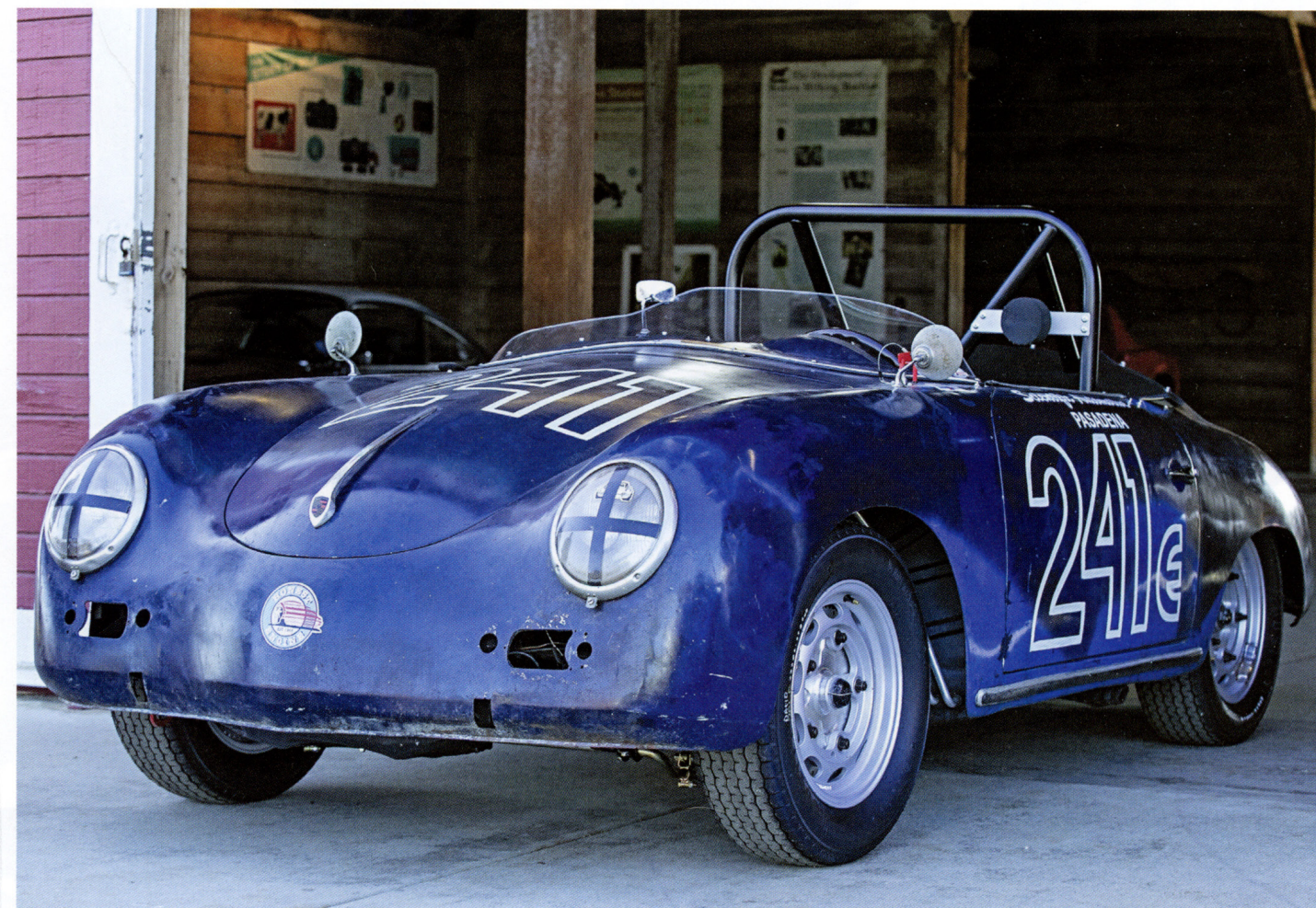
Not a barn find, this racer looked ready to go.