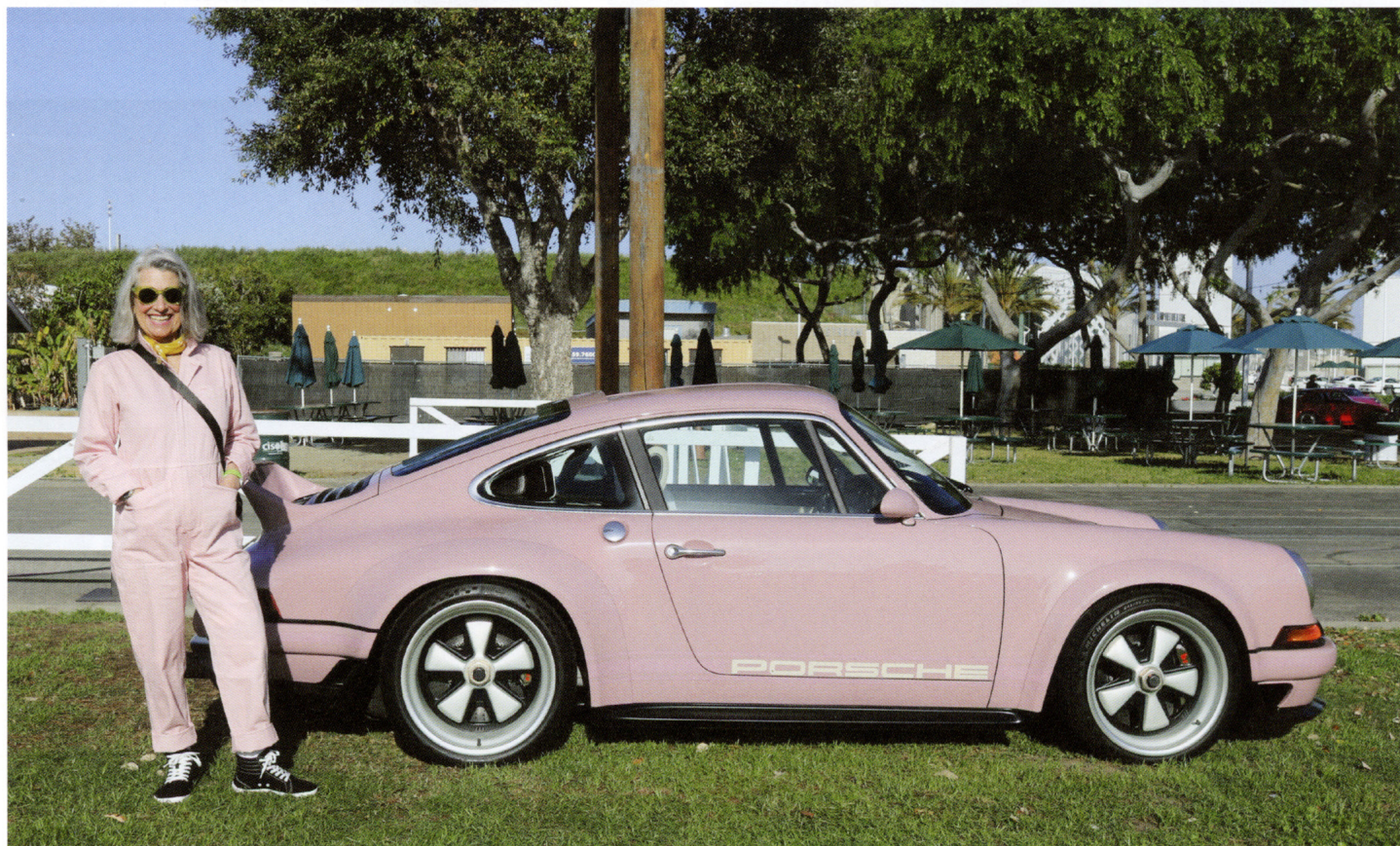
This lady swore she had no connection to the Singer-reimagined DLS Porsche 911 that she happened to match perfectly and completely.