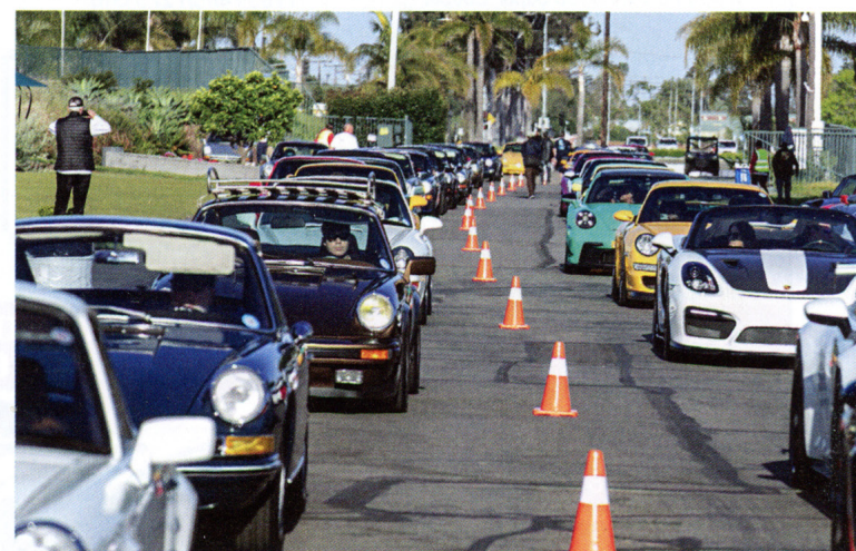
When the gates opened, Porsches of all vintages streamed into the event.

To say that there was something for everyone in the Porsche community would be a vast understatement. This writer prefers not to limit its description to air and water but would say that the event's organic power has harnessed the powers of earth, wind, steam, and fire. 356