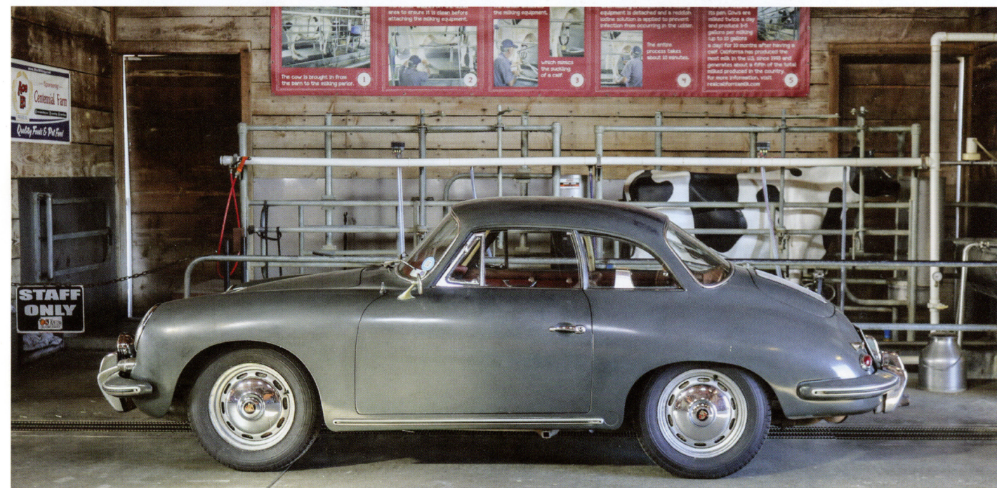
This lonely notchback kept the cows company.