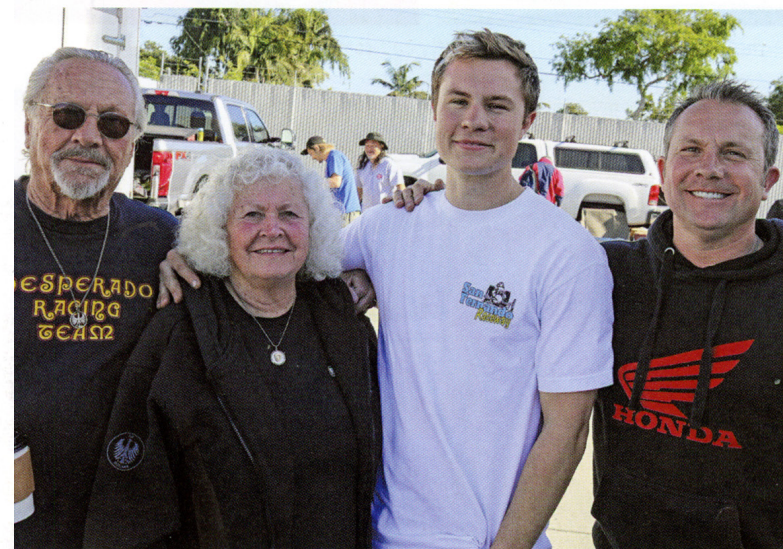
Above left: A good portion of the Emory family was present for the swap meet. Above right: A good portion of the SoCal 356 community attended as well.

attended, it had a distinctly more intimate feel. And just as we've come to expect at Porsche-themed swap meets, interesting items had no problem catching the eyes, and often the cash, of those in attendance.