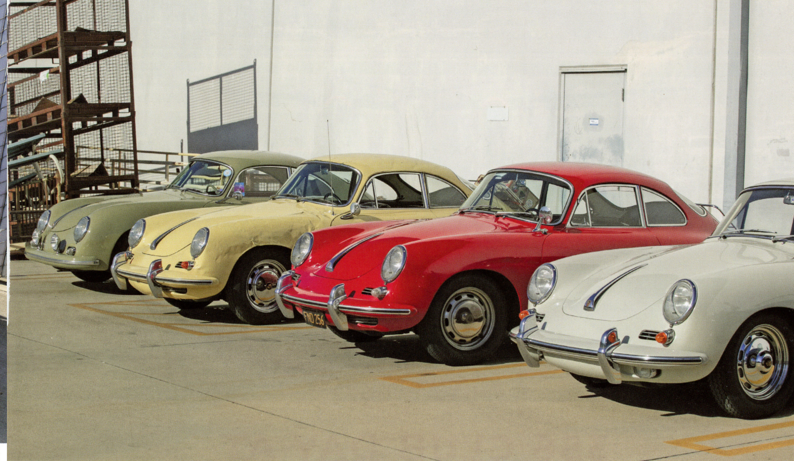
The sunny spring weather was perfect for illuminating the rainbow of Porsche colors.