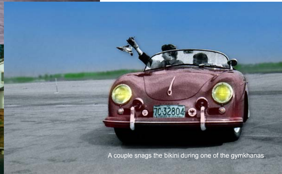
A couple snags the bikini during one of the gymkhanas.